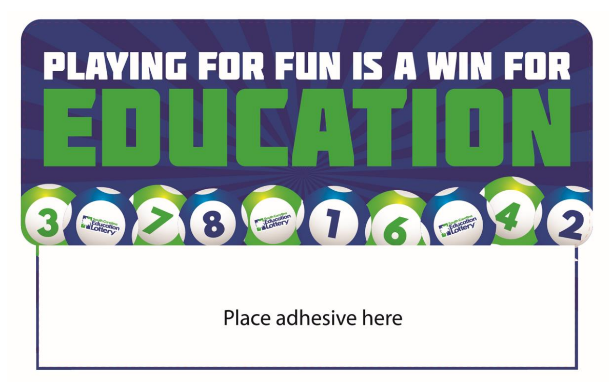
Play Station Topper DRAFT Art BACK