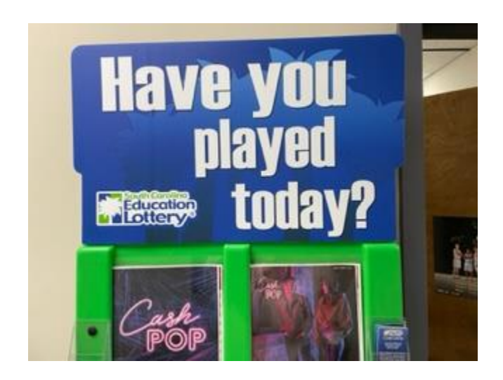
Play Station Topper