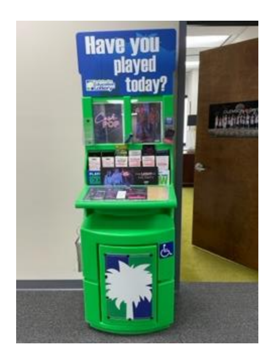
Play Station with Topper

E. Photo of Current Play Station Topper. NOTE: Art is changing.